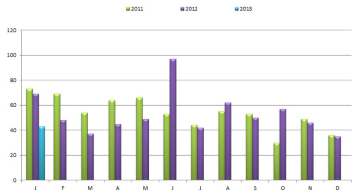
Residential Median days to sell

January has brought a total of 80 residential sales for Marlborough/Kaikoura, down from December's 84 sales. There were 6 section sales reported for the Marlborough/Kaikoura region plus an additional 2 lots from Delta Lake Heights (classed as rural). The average sale price for January was $299,000, a decrease on December's $326,000. Days to sell has increased slightly to 43 days in January up from December's 35 days, but lets look back at the situation in January 2012....48 residential sales, 4 section sales, median sale price of $276,000 and 69 days to sell, makes for an interesting comparison.